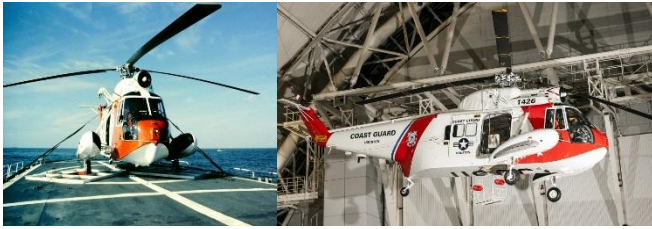
Left: CG1426 as it sits on the back of a Coast Guard Cutter in 1979.

On bookshelves at Ace Hardware in Wewa and at The No Name Café on Reid Ave. in Port St. Joe.